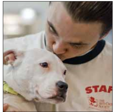
with a Volunteer Rummage Sale.

The Volunteer Department continued to make significant contributions to the daily operations of the shelter. With 506 active volunteers donating a total of 22,786 hours of their time, many shelter services were supported by these dedicated individuals. Shelter volunteers helped facilitate adoptions and animal socialization, assisted the clinic staff by handling animals for physical exams, provided support in the Bruckner Rehabilitation and Treatment Center and the Virginia Butts Berger Cat Clinic, provided support for special events, took photos and uploaded profiles for the Petfinder and The Anti-Cruelty Society's Web site adoption galleries, and raised approximately $2000 for the shelter